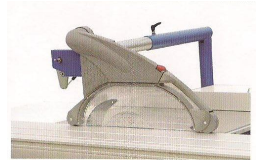
Saw Guard_Type A(Optional)