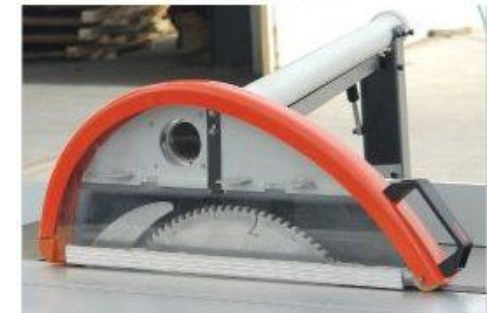
Saw Guard_Type R(Optional)