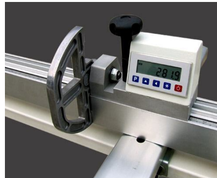
Digital Readout on Crosscut fence(Optional)