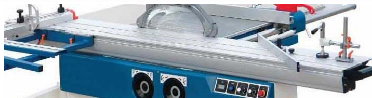
Sliding Table with Round Outlook(Optional)