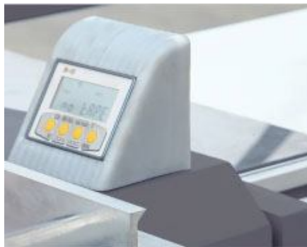
Digital Readout on Rip Fence(Optional)