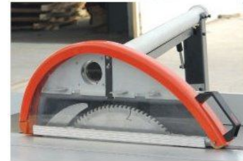
Saw Guard_Type R(Optional)