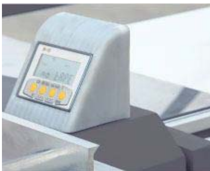
Digital Readout on Rip Fence(Optional)