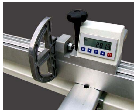
Digital Readout on Crosscut fence(Optional)