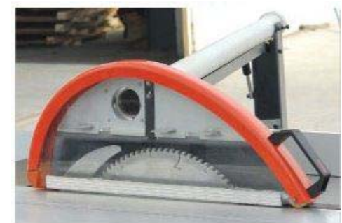
Saw Guard_Type R(Optional)